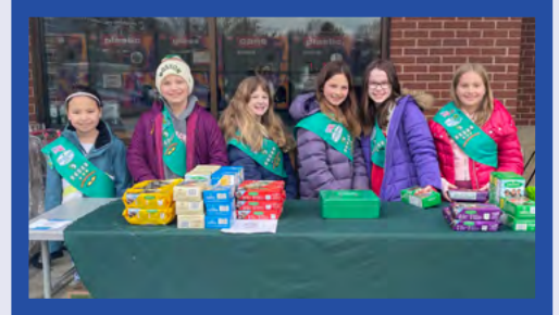
Girl Scout Troop 64049 donated their cookie proceeds to GBFB.