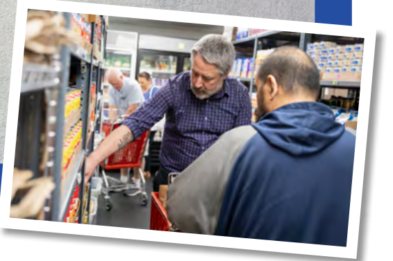
The Wakefield Food Pantry received approximately 172,000 meals in the last year from GBFB.