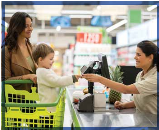
GBFB distributed almost 290,000 grocery cards last year, empowering clients to choose the foods that serve their needs best.

These cards are not intended to replace the critical food distributions at pantries, but they are a supplement to help individuals and families keep food on the table each month. They're also easy for our partners to store and distribute. Just as important, because the cards look like any other gift card, they ensure the dignity of the people we serve.