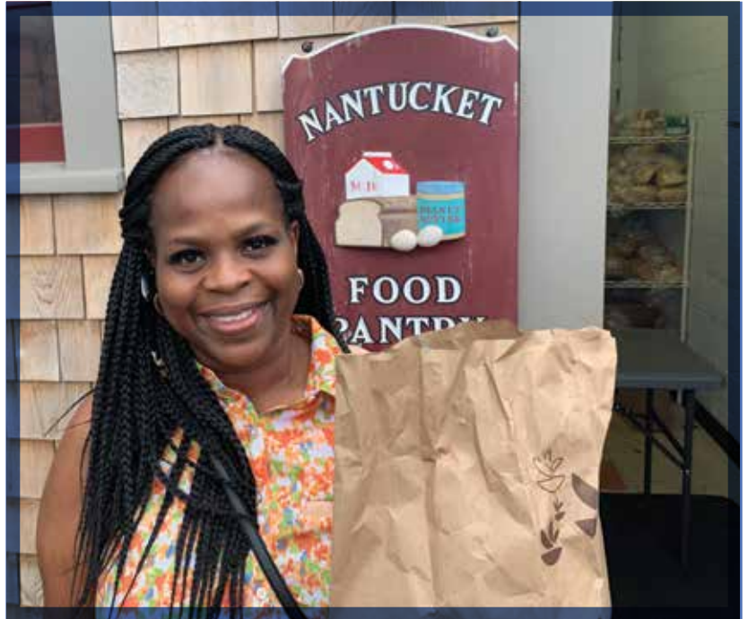
The Nantucket Food Pantry offers assistance year-round to approximately 1700 clients who live on the island.

As one of Massachusetts's top luxury destinations for summer vacations, it may surprise some that food insecurity exists on Nantucket. Like many communities with a regular influx of seasonal visitors, those who live on the island full-time, and those who come to work through the island's busy season, play a big part in supporting restaurants, hospitality, and other businesses in the community at the height of the tourist season. When the season shifts, so does many of the residents' employment and income, which is where The Nantucket Food Pantry steps in to bridge the gap for those who are impacted.